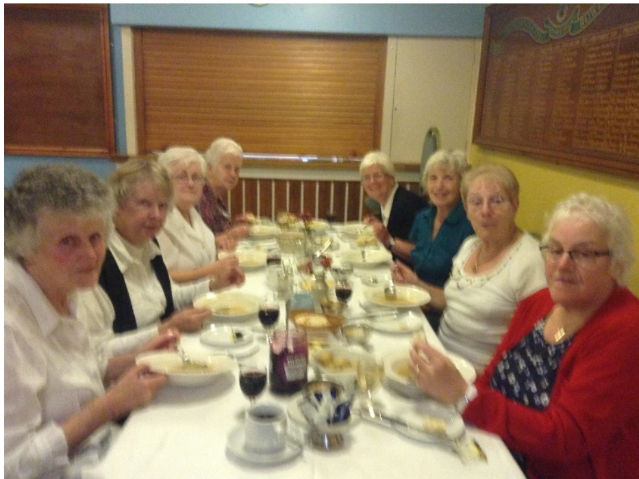
Some of the helpers at the Harvest Supper.